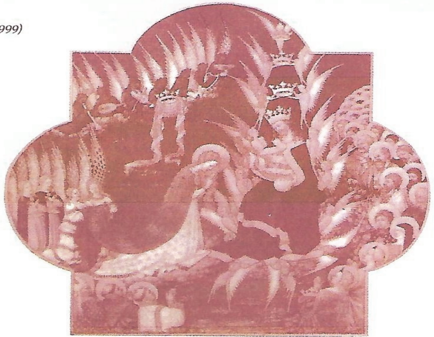
Coronation of the Blessed Virgin Mary Miniature of the Très Riches Heures of the Duke of Berry Limbourg Brothers and Jean Columbe 15th century

"Holier than the Cherubim and Seraphim, she enjoys unquestionably greater glory than all the other saints, for she is full of grace (Lk 1:28), she is the Mother of God, who happily gave birth to the Redeemer for us. Since she is therefore, 'Mother of mercy, our life, our sweetness and our hope,' let us all cry to her 'mourning and weeping in this vale of tears,' and confidently place ourselves and all we have under her patronage. She became our Mother also when the divine Redeemer offered the sacrifice of himself; and hence by this title also, we are her children. She teaches us all the virtues; she gives us her Son and with him all the help we need, for God 'wished us to have everything through Mary'" (MD, 169).