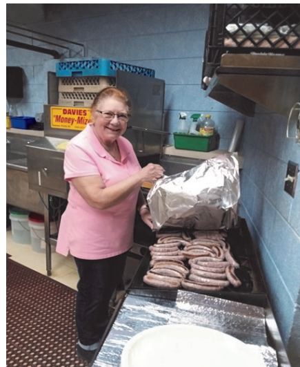
Clean Up Crew & Cooking for Volunteers