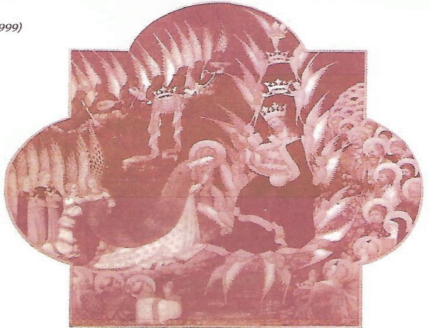
Coronation of the Blessed Virgin Mary Miniature of the Très Riches Heures of the Duke of Berry Limbourg Brothers and Jean Columbe 15th century

"Holier than the Cherubim and Seraphim, she enjoys unquestionably greater glory than all the other saints, for she is full of grace (Lk 1:28), she is the Mother of God, who happily gave birth to the Redeemer for us. Since she is therefore, 'Mother of mercy, our life, our sweetness and our hope,' let us all cry to her 'mourning and weeping in this vale of tears,' and confidently place ourselves and all we have under her patronage. She became our Mother also when the divine Redeemer offered the sacrifice of himself; and hence by this title also, we are her children. She teaches us all the virtues; she gives us her Son and with him all the help we need, for God 'wished us to have everything through Mary'" (MD, 169).