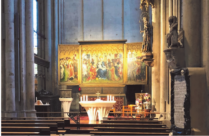
Cologne, Germany Cathedral which houses relics of the Magi

"LIFE GATHERING STAND" in Kenosha: Sat. Jan. 22, 2022, 11am-12pm on the Anniv. of Roe V Wade. People will stand together on corner of 75 th St. & 39 th Ave. holding positive pro-life signs while praying; signs provided that God is Pro-life & abortion is evil. Soup/chili fellowship afterwards at 12:15 in fellowship hall building behind St. Mary's church.