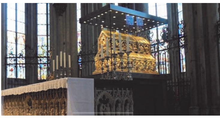
Reliquary with relics of 3 Kings Caspar, Melchior & Balthasar