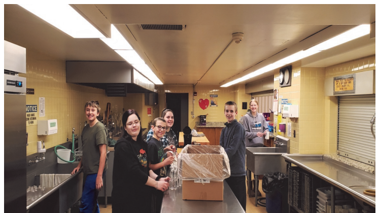
Our Youth Group filling Epiphany bags: THANKS!

Holy Name Society will be having an Italian Beef dinner fundraiser on Sunday, February 13 featuring our famous summer festival Italian beef, buns, salad, dressing, chips and cookies for $35(feeds 4). Additional beef available for $12 a pound. Ordering is on our website and is prepay only. Orders must be in by February 1. Pick up is from 1-3pm on February 13 at St Therese. 2020 91st, Kenosha, WI. 53143. Donations for supplies are welcome.