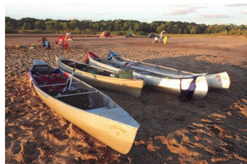
We set up camp on an island