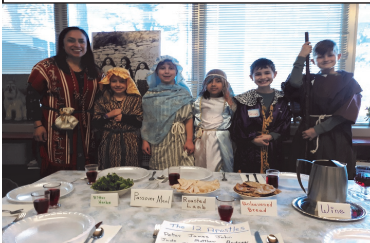
First Holy Communion Class learning about the Passover and the Last Supper.

NOW OPEN 2022-2023 Religious Education Registration for Jr. High & High School Please register online: https://olmckenosha.org/children-and-teens 6th-11th grade classes meet 2 Wednesdays a month from 4:30pm-6:30pm CLASS DATES AND TIMES ARE SUBJECT TO CHANGE