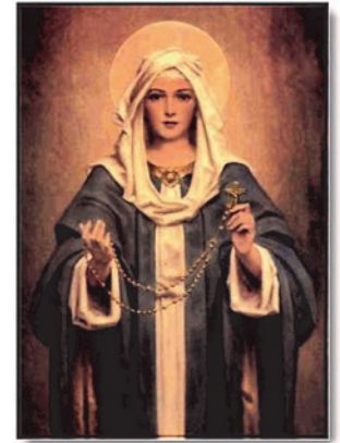
Our Lady of the Rosary Feast Day: Oct. 7

In his encyclical on the Rosary, Pope Pius XI teaches: “Fathers and mothers of families particularly must give example to their children, especially when, at sunset, they gather together after the day’s work, within the domestic walls, and recite the Holy Rosary on bended knees before the image of the Virgin, together fusing voice, faith and sentiment. This is a beautiful and salutary custom, from which certainly there cannot but be derived tranquility and abundance of heavenly gifts for the household” (no. 28).