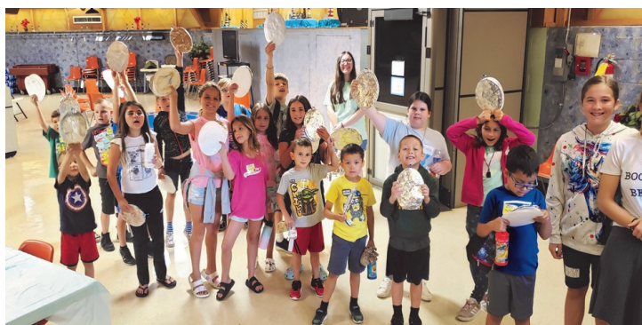
Vacation Bible School students