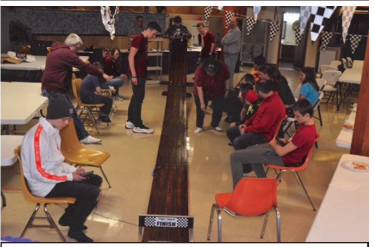
"Troops of St. George Pine Car Derby"