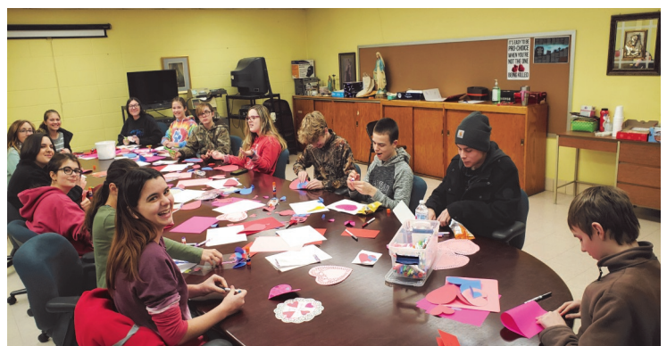
Sat. Feb. 6 our Youth Group made over 100 valentines for residents of Brookside Nursing home! Many thanks!