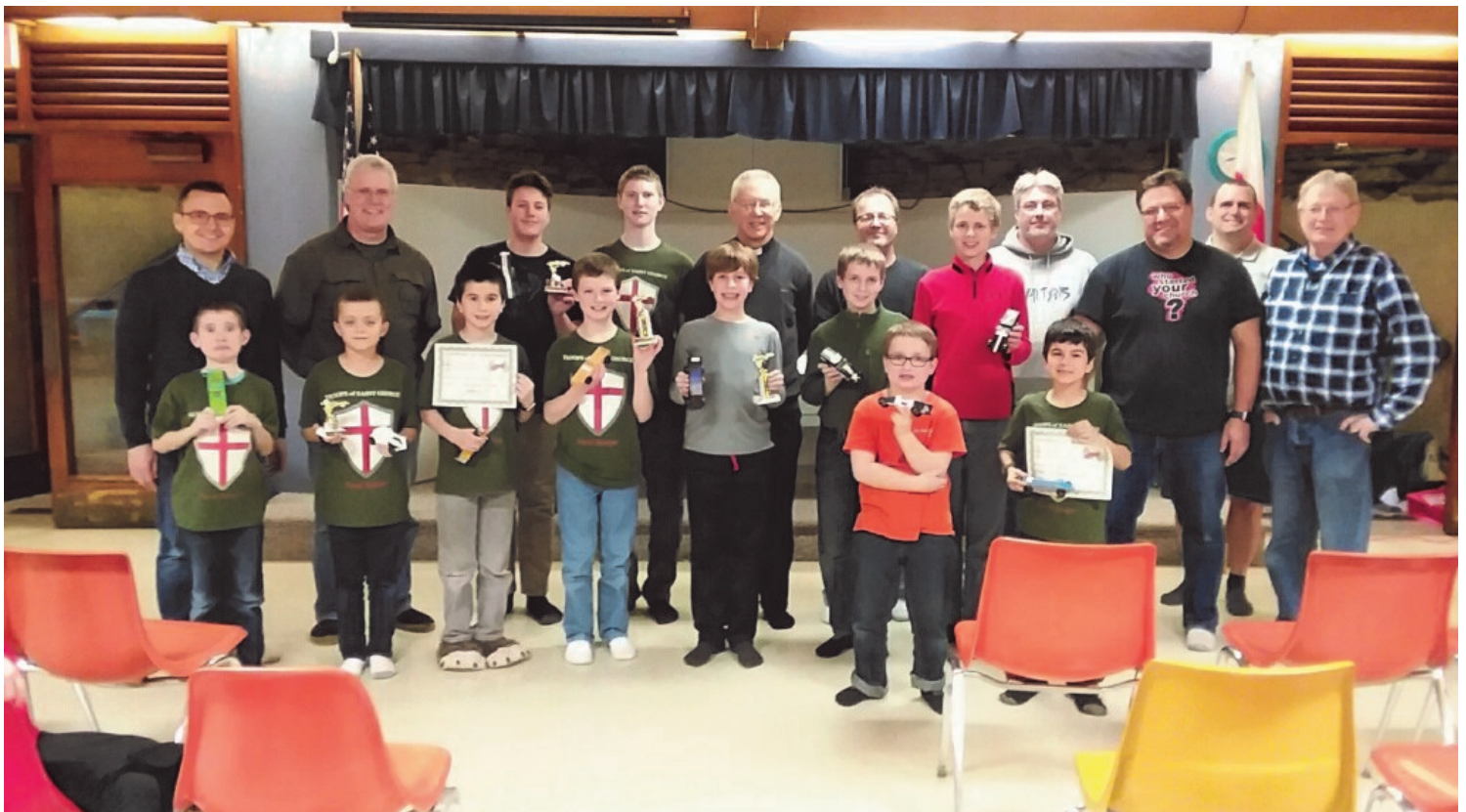
Troops of St. George Pinewood Derby, St. Therese Church

Bishop Kukah said that the Nigerian government is "using the levers of power to secure the supremacy of Islam." He said this "gives more weight to the idea that it can be achieved by violence. With the situation in Nigeria, it is hard to see the moral basis they have to defeat Boko Haram." "They have created the conditions to make it possible for Boko Haram to behave the way they are behaving," the bishop added.