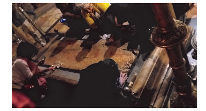
Above: where the body of Jesus was laid before being placed in the tomb, in the Church of the Holy Sepulcher.

Our first stop was in Jordan at Mount Nebo, where Moses and the Israelites overlooked the Promised Land before entering into it. Moses died on Mount Nebo, but no one knows where his body was buried. Joshua then led the Chosen People into the Promised Land, attacking the City of Jericho, where they marched around the city for seven days, and on the seventh day the walls came tumbling down.