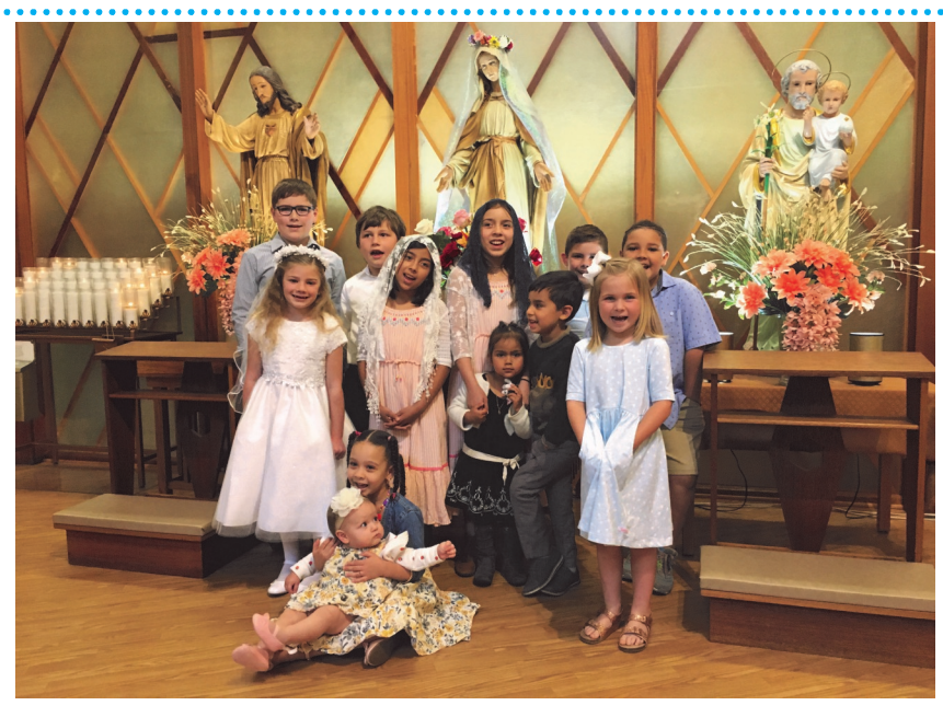
May Crowning Procession with children on Mother's Day.