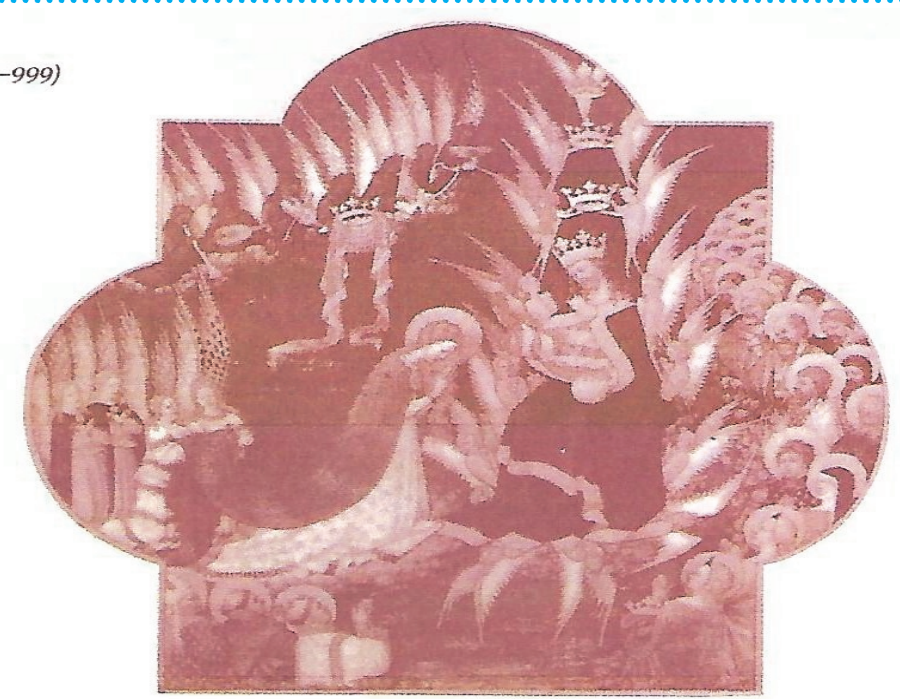
Coronation of the Blessed Virgin Mary Miniature of the Trés Riches Heures of the Duke of Berry Limbourg Brothers and Jean Columbe 15th century

"The divine Motherhood of Mary is the source of all the perfections and privileges with which she is endowed. Because of it, she was conceived immaculate and is full of grace; because of it, she is ever virgin, she was taken up body and soul to heaven and has been crowned Queen of all creation, above the angels and saints. Greater than she, none but God. The Blessed Virgin from the fact that she is the Mother of God has a certain infinite dignity which comes from the infinite good, which is God. There is